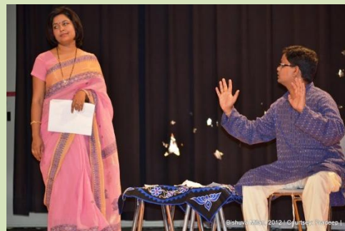
Sahitya Chasha, 2012