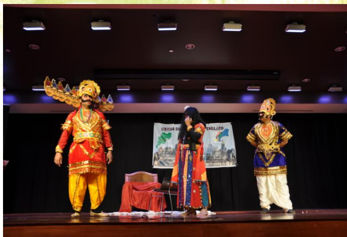
Dasanana@2010: NAKA KatA UpAkhyAn

Billboard presentation in the dining area showcased the OSNE past activities and fliers of organizations promoting education, and culture related to Orissa. Vegetarian dinner was served and people got opportunity for social networking among Odia Diasporas.