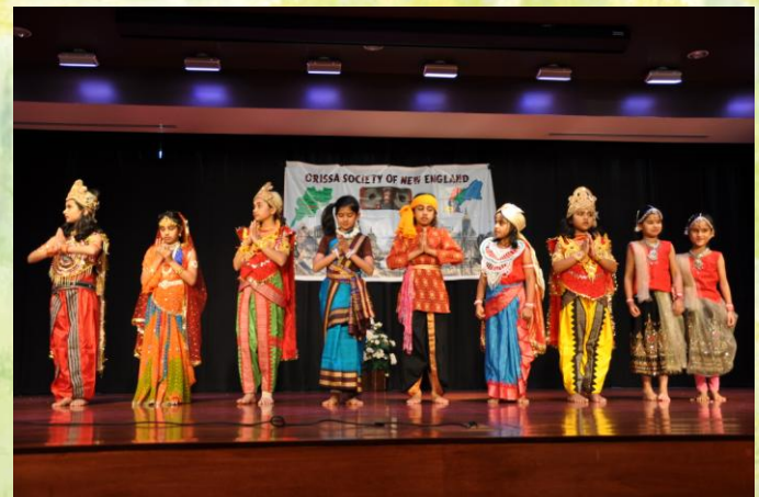
Kanchi Abhiyan – by OSA NE Junior Artist