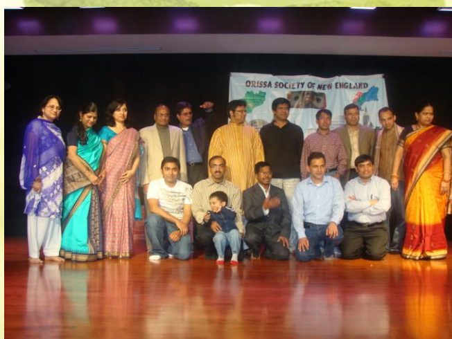
OSA NY NJ Team