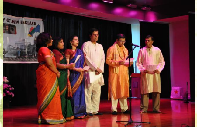
Bande Utkala Janani – by OSA NE